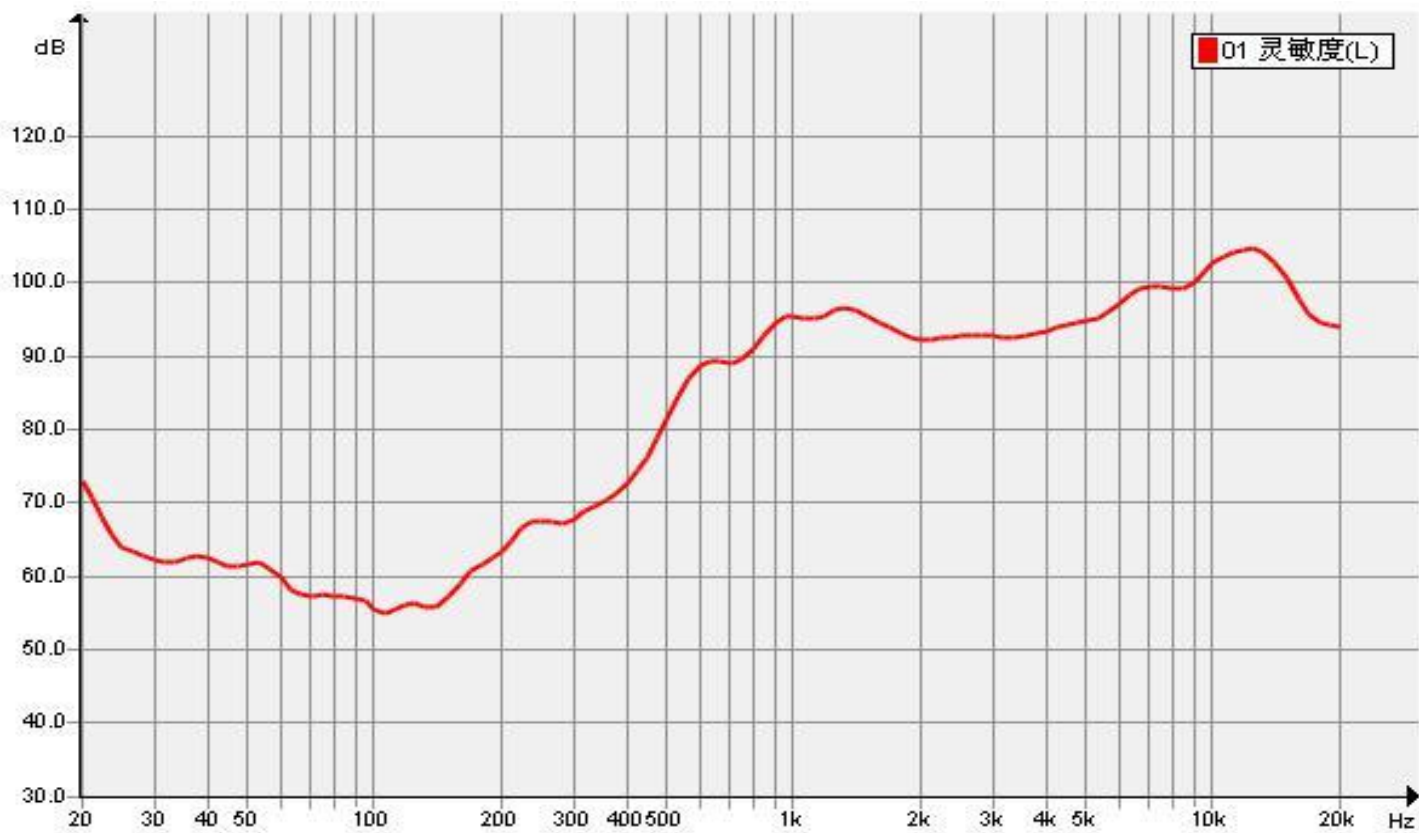
F0 Curve (only for reference)